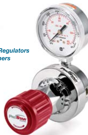
2006 Series - Special Purpose Regulators for Liquid Containers