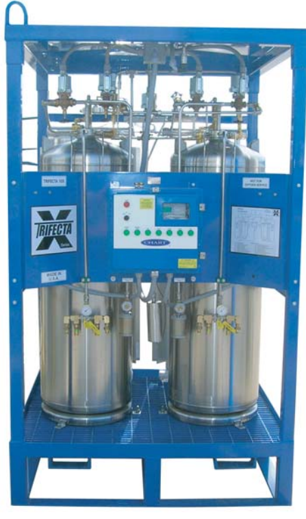
Models X5, X10, X15