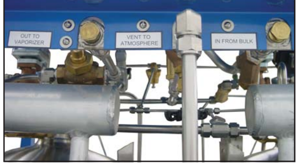
Two Main Connections Simplify Installation