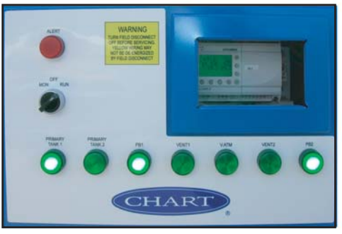
Visual Indication for Operation Modes